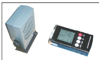
Testing ion Balancing of ESD ionizers

Measures static charge on ESD Floors/Table Mats/Wrist Straps/Hand Gloves/ESD Bags/other ESD items