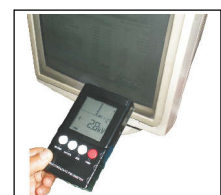
Testing PC Screen Static Charge

Warranty is 12 months from the date of invoice. It excludes any mechanically damaged and electrically misused part.