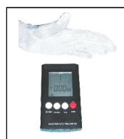
Testing ESD Safe Hand Gloves