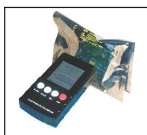
Testing ESD Packing Bags