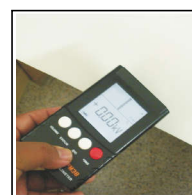
Testing ESD Table Mats