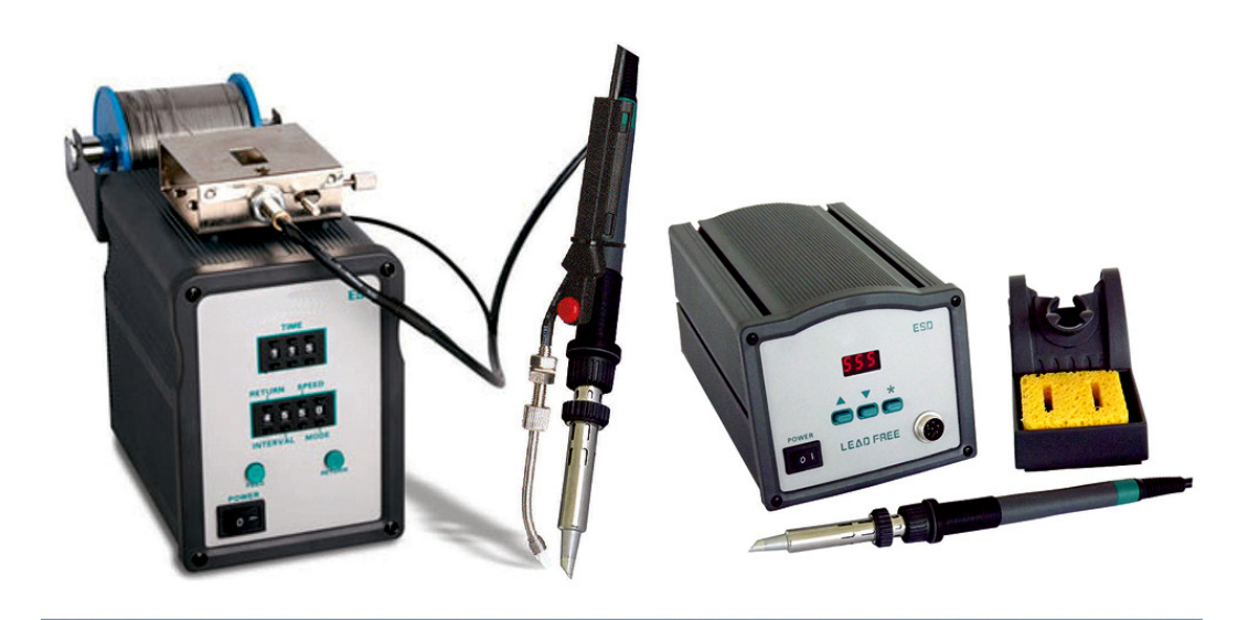
SOLDERING STATIONS (WITH SOLDER FEEDER) DSF73E + HIGH MASS SOLDERING STATION DSSHP03G

A Soldering Station is an 'adjustable temperature' based soldering device designed for soldering through-hole and SMD electronic components. It is primarily used in electronics and electrical engineering world. A Soldering Station has one or more soldering tools connected to the main control unit (CU), which includes manual/automatic temperature controllers, temperature/ timer indicator display etc. The main unit may contain a transformer depending on the wattage offered by the Soldering Station.