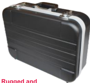
Rugged and Long life durable expensive hi-Quality Tool Case