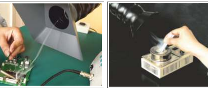
Fumes Air Purification during hand soldering on PCB & Solder Pot tinning