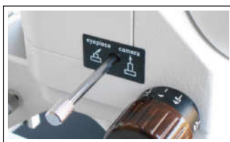
Switch between Video and Eyepiece View

You can alternate the eyepiece observation and video capture by pushing or pulling the pole.