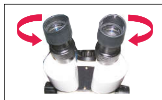
Independent Diopter Adjustment for each ocular

You can alternate the eyepiece observation and video capture by pushing or pulling the pole.