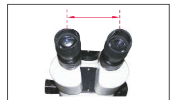
Adjustable Interpupillary Distance

provided on both ocular to correct for specific eye-vision of users