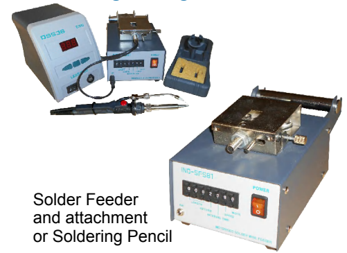
Solder Feeder and attachment or Soldering Pencil

Optional Solder Wire Feeder for higher production rate with everyday saving of recurring wastage of solder wire