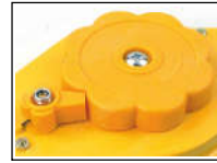
Rotary Cap to set the load capacity