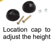
Location cap to adjust the height