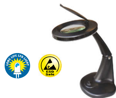
Table Clamp type LED Illuminated QC Magnifier