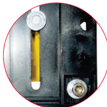
High quality heavy duty Screws for channels