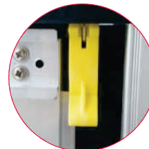
Hi-Quality, easy-to-adjust Lever mechanism in place of screws