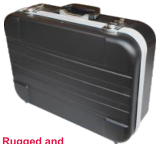
Rugged and Long life durable expensive hi-Quality Tool Case