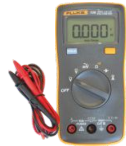
FLUKE Digital Multimeter *