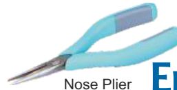
Nose Plier Erem Switzerland