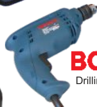
BOSCH Drilling Machine