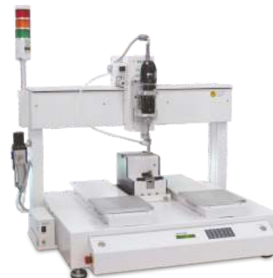
Model EC513YA Double Y Axis Design independently controlled