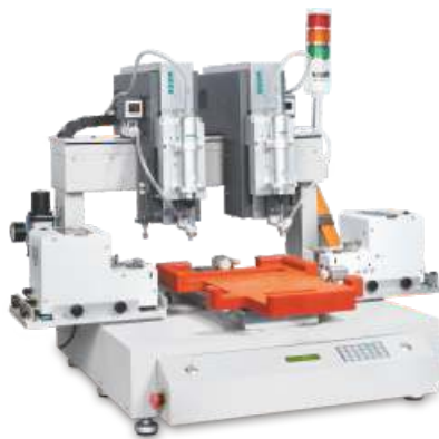
Model EC423 Double Head design