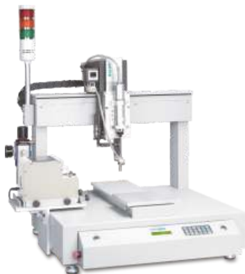
Model EC413 Single Head design

Screws feeding with counting at high production rate & also prevents missing of screws