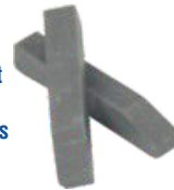
Spare Set of Carbon Electrodes available