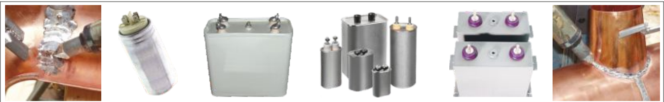
Examples of very heavy duty soldering jobs such as high power oil capacitor cans sealing, Ducts etc.