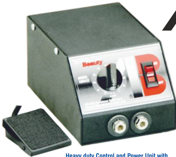
Heavy duty Control and Power Unit with ON/OFF Foot Switch saves electrical energy.

Provides aerospace level hi-reliability in interconnection of Coax Cable assembly