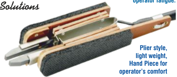
Light-weight, palm-sized Hand Piece with comfort grip padding minimizes operator fatigue.