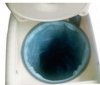
( picture 03)

3、 Be sure that the bag is fix well (see picture 03) , and top cover of machine has been totally covered before using.