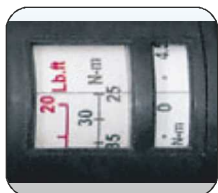
Simple adjustment of the pre-set value on an easy-to-read scale