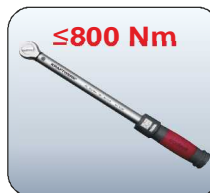
Range up to 800 Nm with an accuracy of \pm 4\%