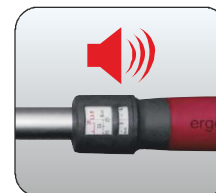
Audible signal when set torque is reached.