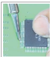
SMD ICs soldering