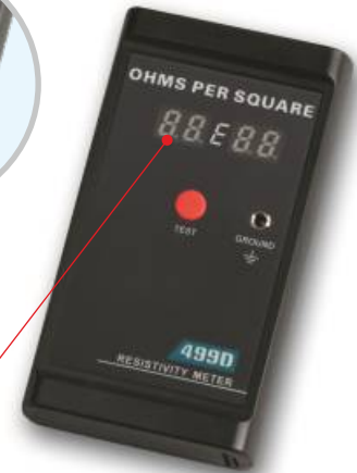
Digital display readout