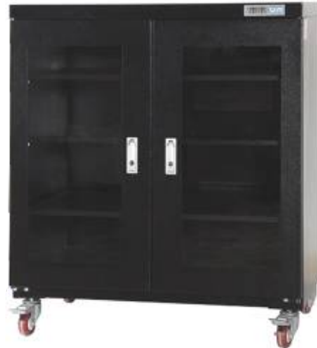
5~50% RH, 320L Dry Storage Cabinet Model: IDSC-320