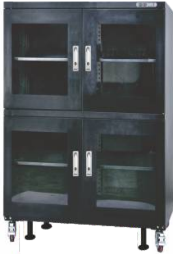
5~50% RH, 510L Dry Storage Cabinet Model: IDSC-510

Conforms to IPC/JEDEC J-STD 033C Standards for storing even expensive IC packages