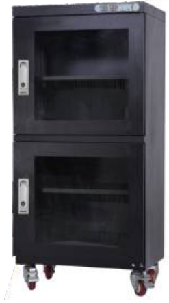
5~50% RH, 240L Dry Storage Cabinet Model: IDSC-240