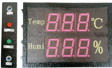
Optional LED Display for Alarm